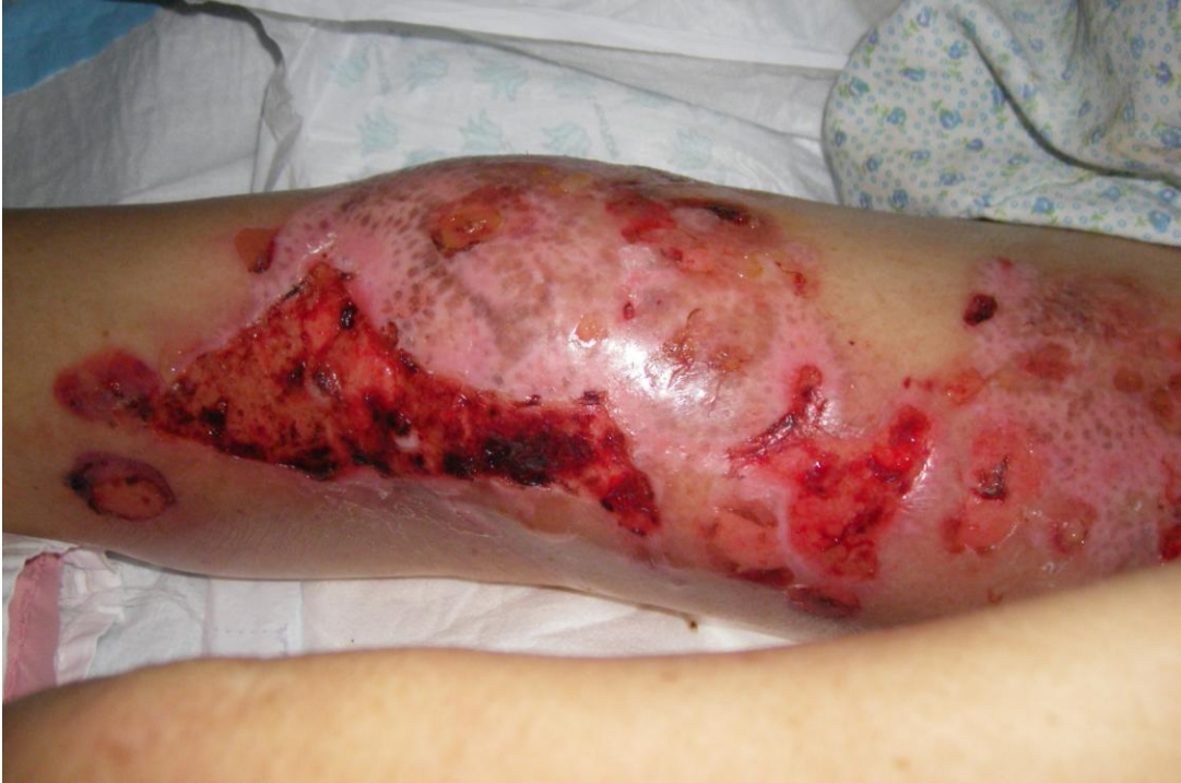
Ten Days After Silver Sol Treatment. Note islands of epithelialization (indicating stem cell activity).